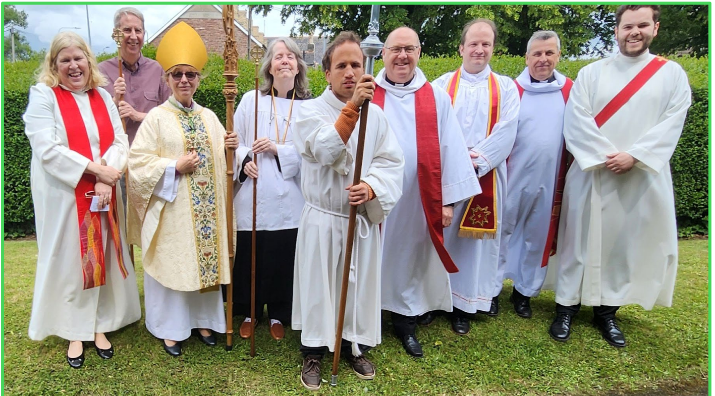
Pentecost TWMA Combined Service in All Saints' Llandaff North